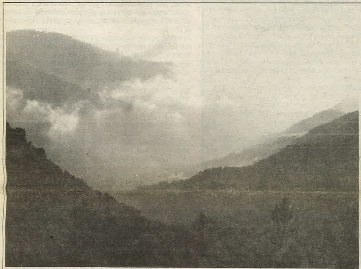
Ventana Wilderness, Los Padres National Forest, looking down from Hare Canyon to the sea from Cone Peak. The Los Padres will soon boast new wilderness areas—and spotted owl habitat.