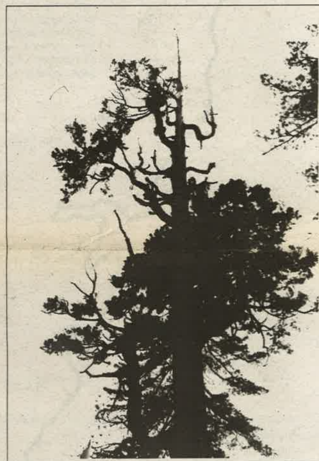
Red Mountain WSA in Mendocino County. Incense cedar, Calocedrus decurrens , grows in the rare lateritic soil.

Bakker speaks of the distinctive interaction between native species and California's wild areas. "Like the...pines,