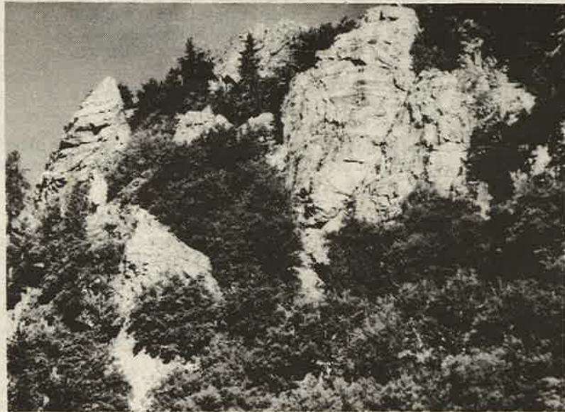
Los Padres National Forest, from Cone Peak trail

The Los Padres legislation is supported by both Senators Cranston and Seymour, and by