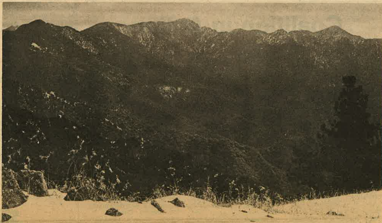
Oil and gas drilling is proposed for the Ventana Wilderness

Since the 257 proposed leases in California involve oil and gas exploration, the recommendations of the Forest Service also must be approved by Interior